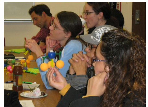
The Noyce Seminars will continue next year supported by MSTI

CEMaST offers a seminar series for students to learn about teaching as a career and to promote innovative and effective teaching strategies. The seminar series begins with a fall reception and continues to meet once a month during the academic year. Past seminars include teaching demonstrations from local teachers, K-12 classroom video analysis of teaching and learning, review of educational research papers, resume development, and interview techniques.