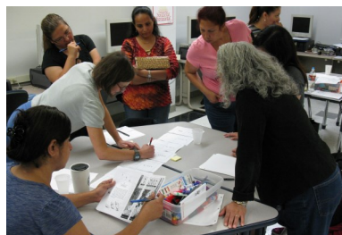
Teachers at SGVMP workshop