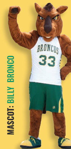
MASCOT: BILLY BRONCO

NCAA DIVISION II ATHLETICS WITH 11 TEAMS