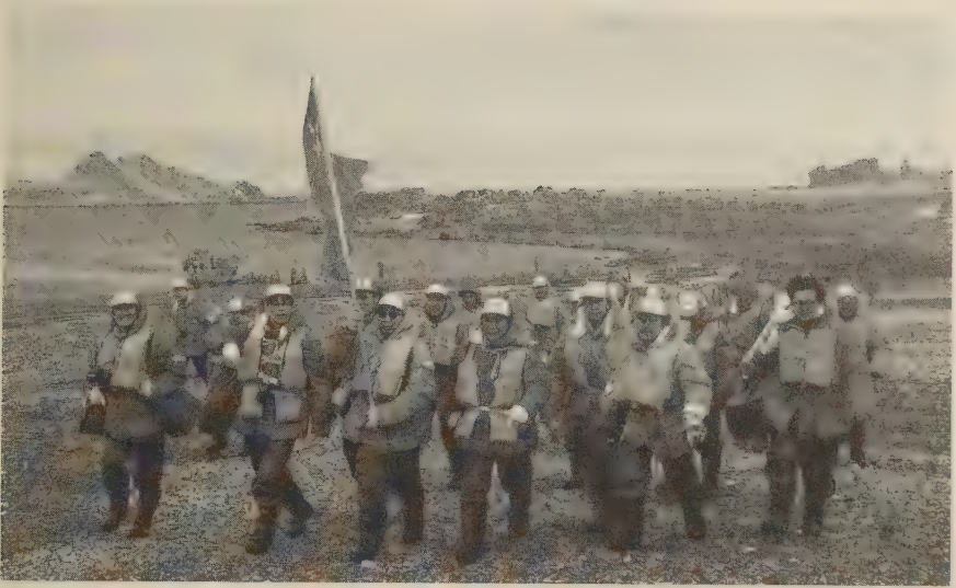
FIGURE 1. Chinese Antarctic expedition landing on King George Island, January 1984. From Chinese Arctic and Antarctic Administration, Chinese Arctic and Antarctic Expeditions (Beijing: Ocean Press, 2000).

when expedition members bellowed out a new team song that praised “close comrades, loyal partners, we expedition members are good sons of China, good sons of China.” 41 Upon their insistence, and with Wu Heng’s approval, eight members of the expedition stayed behind at the Great Wall for the austral winter, apparently a rare feat during the first year of any station. 42