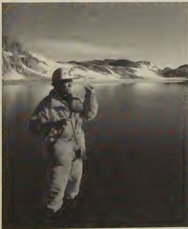
FIGURE 5. Chinese scientist collecting plankton in an Antarctic lake.

In late 2004 and early 2005, with increased government and corporate funding, the twenty-first Chinese Antarctic expedition launched a new ambitious effort to march into Dome A to study the ice sheet and to establish a temporary station in preparation for a permanent station there in the near future. Scientifically, it was potentially the most original of all Chinese Antarctic research, because Dome A and the surrounding Gamburtsev range had never been systematically studied before. 100 Characteristically, in the Chinese press, it was billed as a project to seize the last of the four significant “spots” in Antarctica: The US had taken the South Pole, the French the magnetic pole, the Russians the coldest spot, now the Chinese would occupy the highest point on the ice sheet, dubbed “the commanding height” of Antarctica. 101