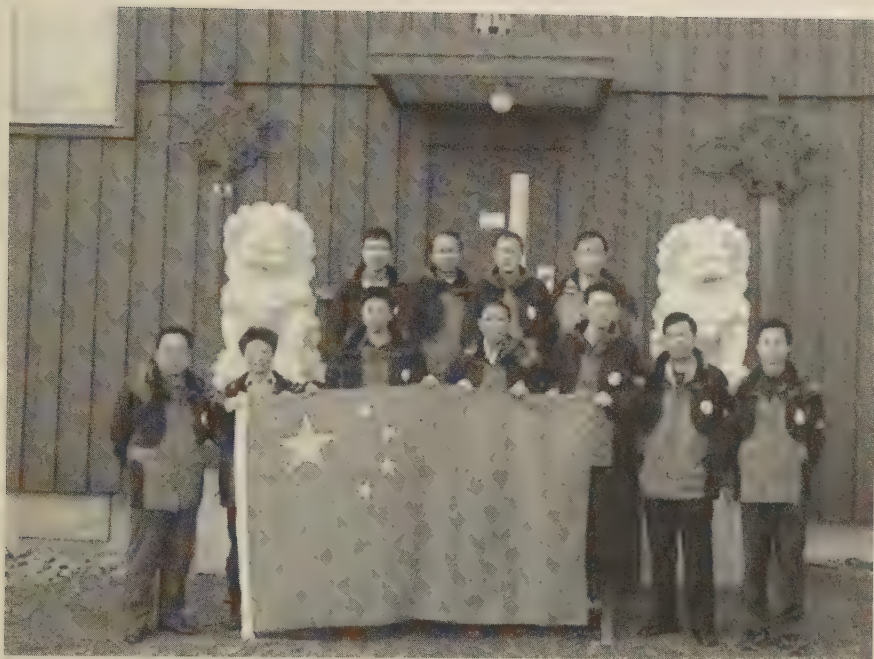
FIGURE 4. The opening ceremony of China's Yellow River Arctic station at Svalbard, Norway, 2004.

number of journalists (about twenty) from many media outlets on board to report back to their vast audience anxiously tracking the progress of the expedition. 92